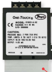
Optional NPT Connection Block